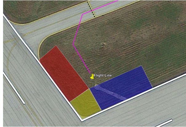
Flight Line Tents. The Red tents will be assigned the Red runway. The Blue tents will be assigned the Blue runway.

The following must be the configured lost comms RTH/RTL and flight termination point.