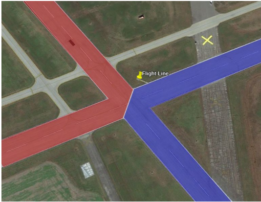
Assignable Runways. The Red runway extends to the North and West. The Blue runway extends to the South and East.